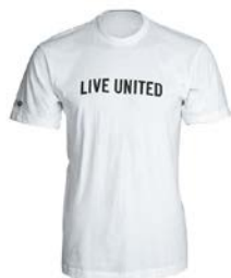
Live United T-Shirt

These are just some of the supplies available to help you promote your campaign. For a complete list check out www.unitedwaystore.com .