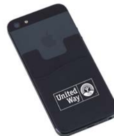
United Way Phone Case