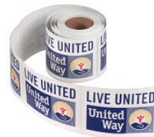
Live United Stickers